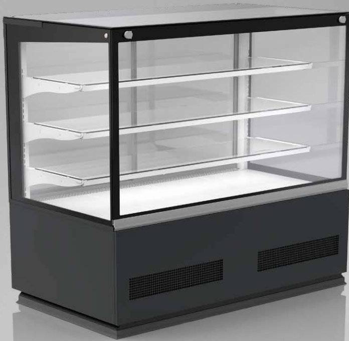
Elegant RDEL-21 1400 GDT