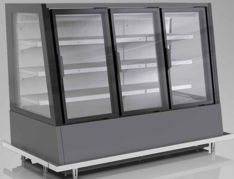
Everest RNEV-21 1950 DTO