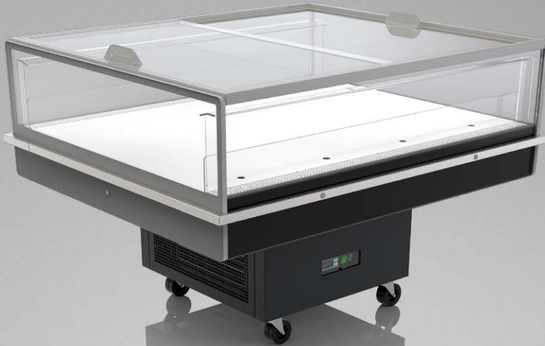
Fiji LDFI-25 1250 CSS

BSA – low glass or front glass riser | single, straight | fixed CSS – cover | single, straight | sliding (sideways)