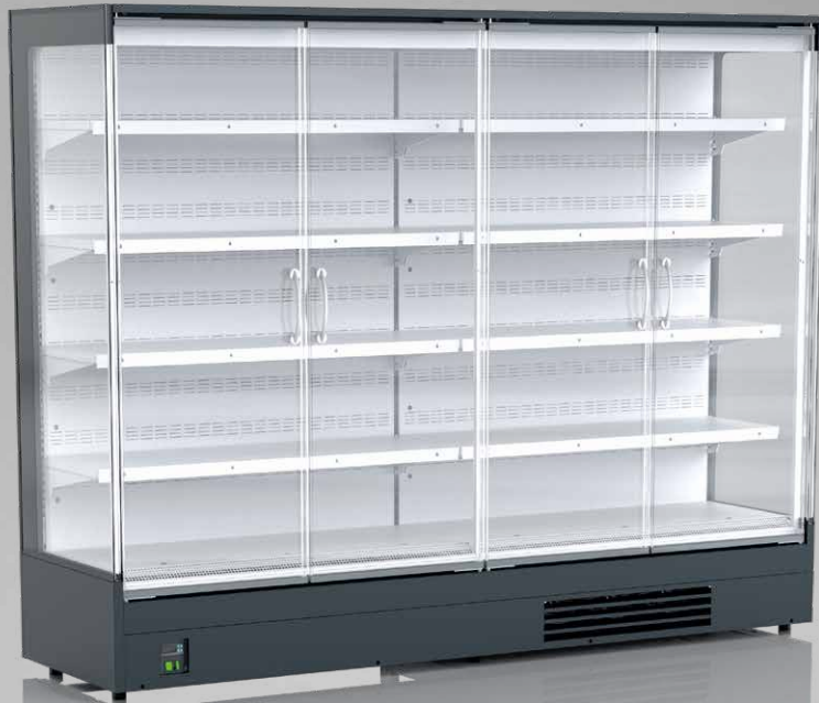
Garmo RDGA-L5 2500 DVO

DVO – door | double, straight (High Vision) | hinged DDS – door | double, straight | sliding (sideways)