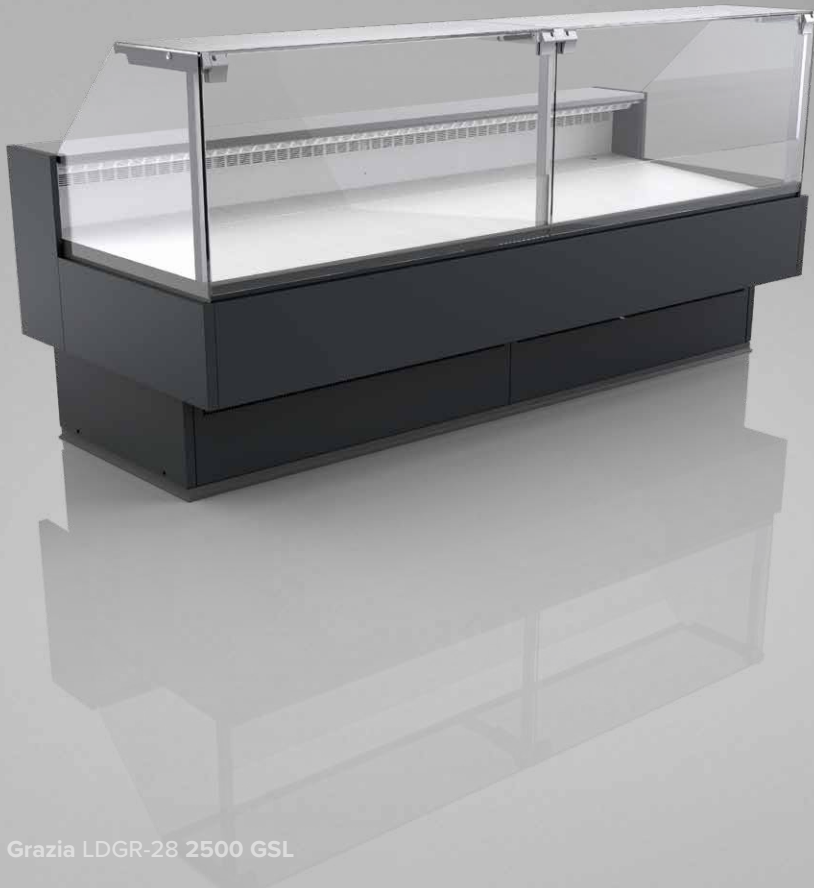
Grazia LDGR-28 2500 GSL

GSL – glass | single, straight | lift up